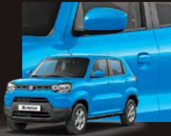
Pearl Starry Blue Z2S