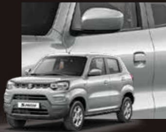
Metallic Silky Silver Z2S