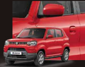
Fire Red Z4Q