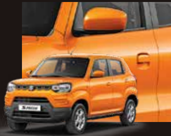
Sizzle Orange Z2T