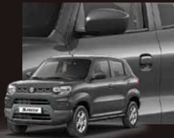
Metallic Granite Grey Z2N