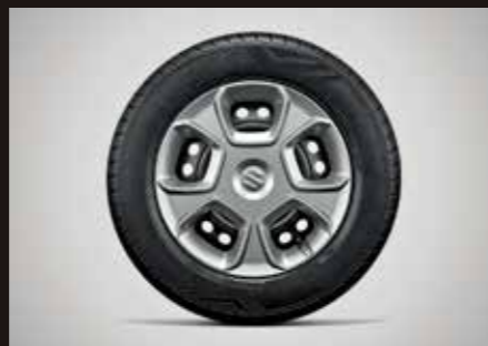
14-INCH STEEL WHEEL (FULL WHEEL COVER)