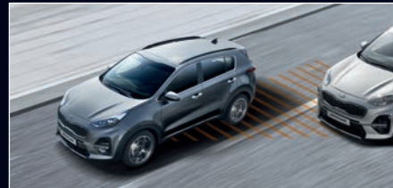
Blind Spot Detection 1 (GT-Line)