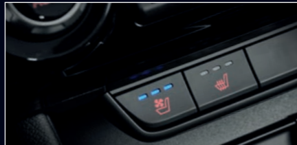
Heated and Ventilated Front Seats (GT-Line)