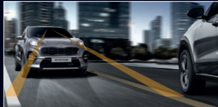
Lane Keeping Assist 1