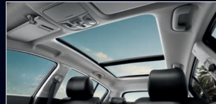
Panoramic Sunroof (GT-Line)