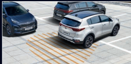
Rear Cross Traffic Alert 1 (GT-Line)