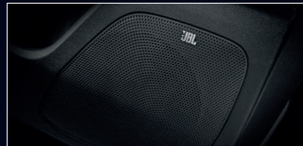
JBL® Premium Sound System (SX, SX+ and GT-Line)