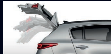
Smart Power Tailgate (SX+ & GT-Line)