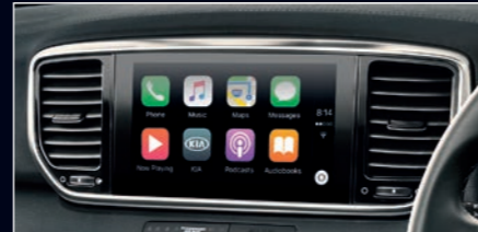
Smartphone Connectivity 2