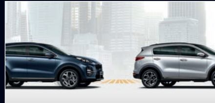
AEB Safety 1