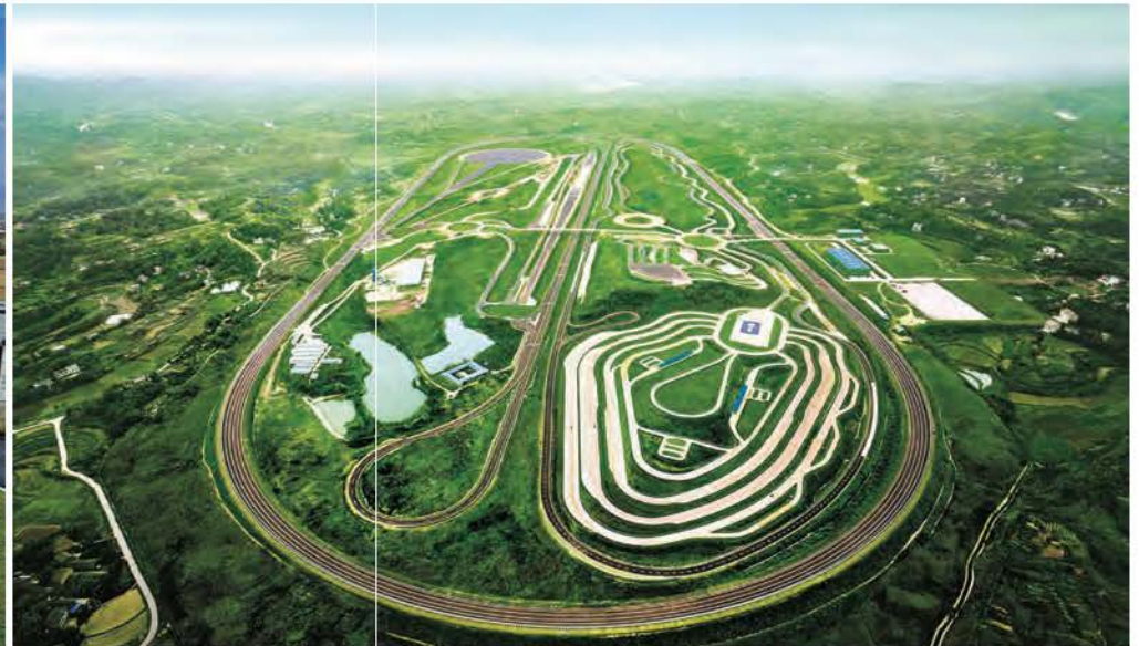
CHANGAN TEST TRACK CHONGQING DIANJIANG DISTRICT

Covering an area of over 2,240,000 m 2 , having 12 test tracks, including high speed, brake and performance testing tracks.