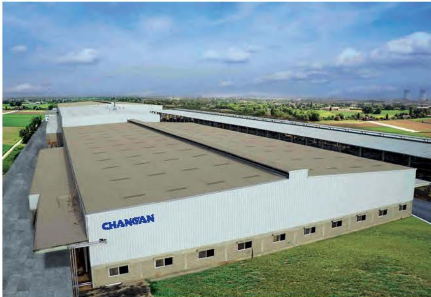
MASTER CHANGAN ASSEMBLY PLANT

Changan Automobile's Product Test and Verification System: CA-TVS with more than 4 million km in test mileage, each new model is to undergo 4,500 tests in 15 areas, including environment, strength, safety, etc. Changan is committed to provide its customers with a safe and enjoyable ride.