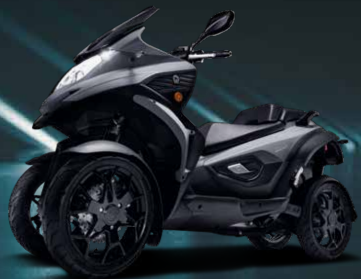
TITANIUM GREY (MATT)